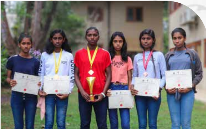
Team SOS at The National Independence Cup Taekwondo Championship 2023 Girls from SOS Children's Village Anuradhapura