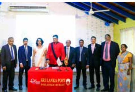
40th Year Commemorative Stamp and First Day Cover

Post Sri Lanka released a postage stamp and a special First-Day Cover.