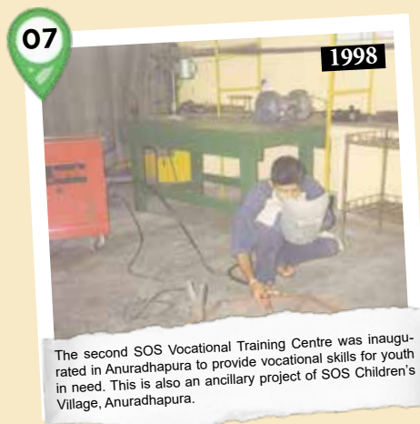
The second SOS Vocational Training Centre was inaugurated in Anuradhapura to provide vocational skills for youth in need. This is also an ancillary project of SOS Children's Village, Anuradhapura.