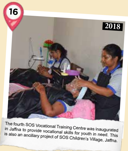
The fourth SOS Vocational Training Centre was inaugurated in Jaffna to provide vocational skills for youth in need. This is also an ancillary project of SOS Children's Village, Jaffna.