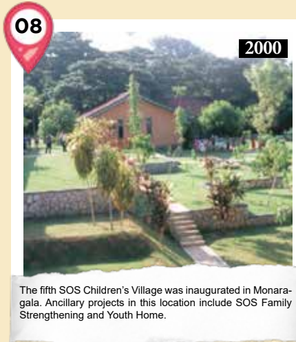
The fifth SOS Children's Village was inaugurated in Monaragala. Ancillary projects in this location include SOS Family Strengthening and Youth Home.