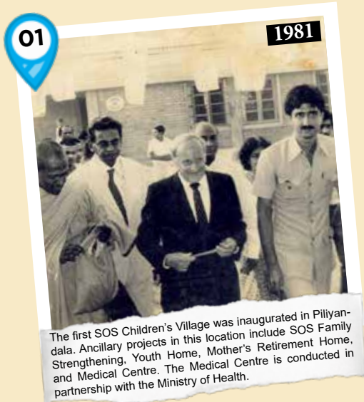
The first SOS Children's Village was inaugurated in Piliyandala. Ancillary projects in this location include SOS Family Strengthening, Youth Home, Mother's Retirement Home, and Medical Centre. The Medical Centre is conducted in partnership with the Ministry of Health.