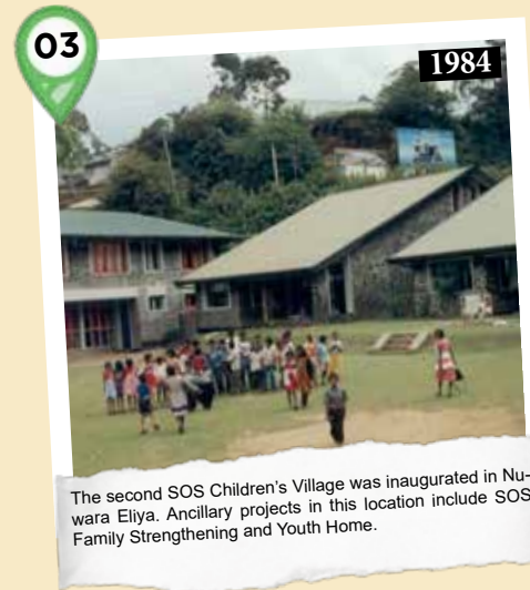
The second SOS Children's Village was inaugurated in Nuwara Eliya. Ancillary projects in this location include SOS Family Strengthening and Youth Home.