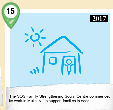
The SOS Family Strengthening Social Centre commenced its work in Mullaitivu to support families in need.