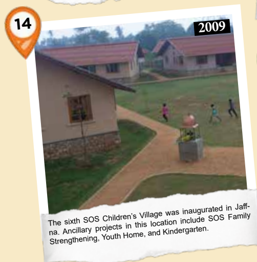
The sixth SOS Children's Village was inaugurated in Jaffna. Ancillary projects in this location include SOS Family Strengthening, Youth Home, and Kindergarten.