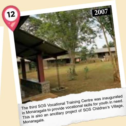
The third SOS Vocational Training Centre was inaugurated in Monaragala to provide vocational skills for youth in need. This is also an ancillary project of SOS Children's Village, Monaragala.