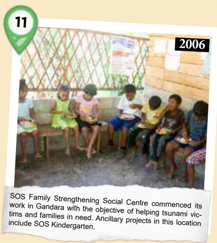
SOS Family Strengthening Social Centre commenced its work in Gandara with the objective of helping tsunami victims and families in need. Ancillary projects in this location include SOS Kindergarten.