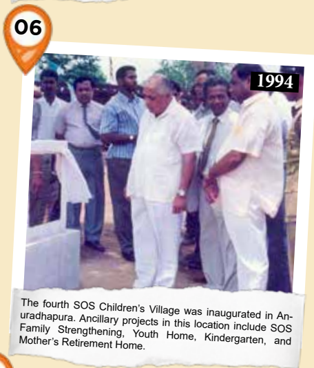
The fourth SOS Children's Village was inaugurated in Anuradhapura. Ancillary projects in this location include SOS Family Strengthening, Youth Home, Kindergarten, and Mother's Retirement Home.