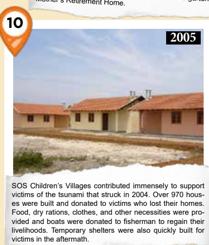
SOS Children's Villages contributed immensely to support victims of the tsunami that struck in 2004. Over 970 houses were built and donated to victims who lost their homes. Food, dry rations, clothes, and other necessities were provided and boats were donated to fishermen to regain their livelihoods. Temporary shelters were also quickly built for victims in the aftermath.